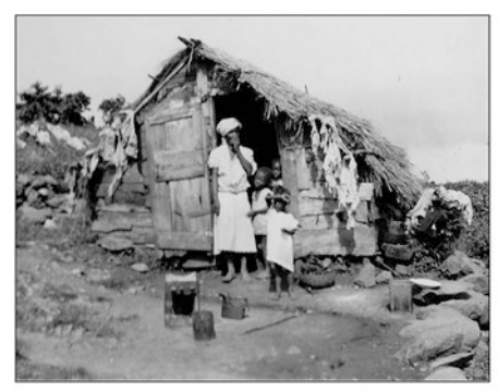
A. Hut with family who answered Engledow's food questions in Tortola