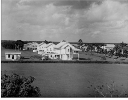
B. The British overseer's quarters at Blairmont Sugar Estate, British Guiana