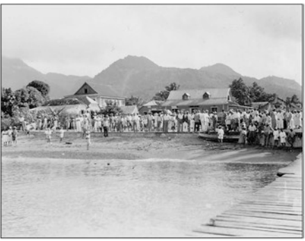
B. The commission's landing at Portsmouth Dominica, 1939