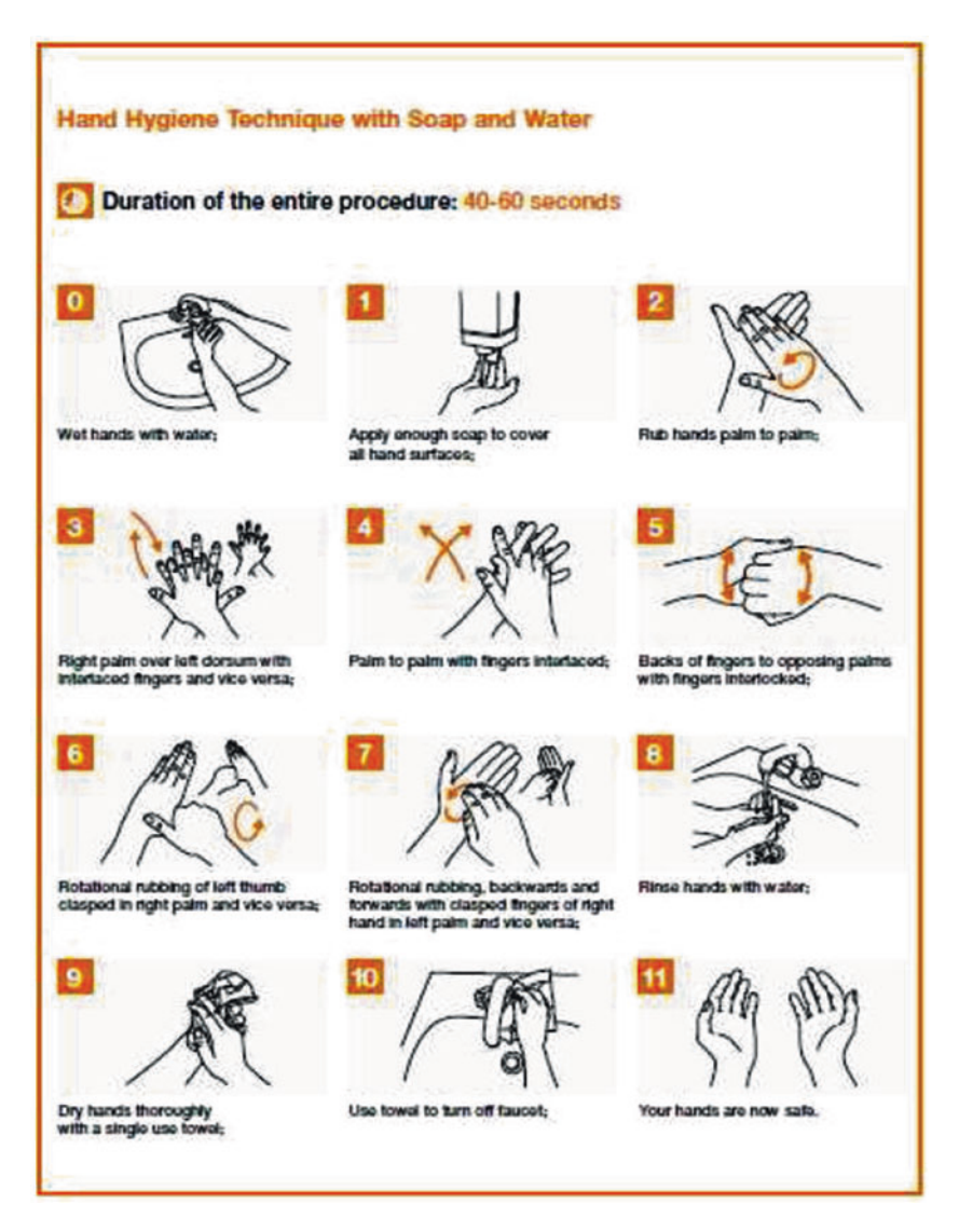
Fig. 5.1 Ministry of Health guidance on Hand Hygiene (2014)