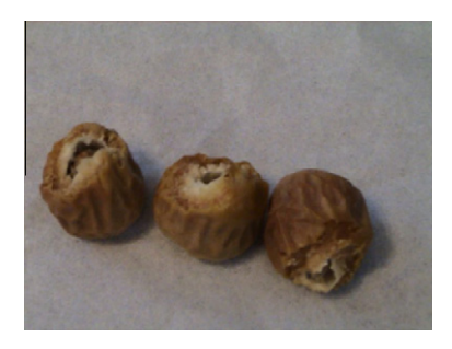
Figure 7 Bruises.