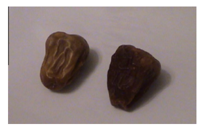
Figure 5 Flabbier fruit is brighter.