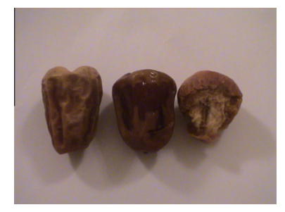
Figure 8 Grades 1, 2 and 3 fruit samples (from left to right).

To classify dates we studied two BPNN models. The first model has three layers: input layer, one hidden layer and an output layer. The input layer has five neurons representing five feature