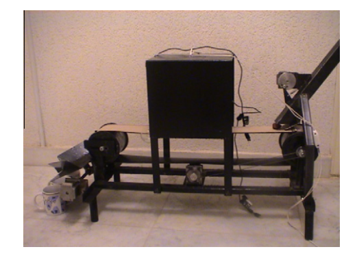
Figure 9 Date fruit grader sorter prototype.

(3) The grade 3 fruit were misclassified as grade 1 because of the variations in the defect feature. The reasons for the misclassification were mainly due to the limited visibility of the defects. The subnormal visibility affected the extraction of size and the shape features.