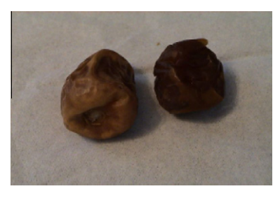
Figure 6 Bird flicks.

We have observed that the better quality date yield high intensity images. The intensity is estimated in terms of the number of wrinkles. The number of edges was considered as the number of wrinkles. To determine the intensity the image is binarized and edges are extracted using Sobel operator and labeled. The intensity measure is defined as I = \frac{a}{A} , where a is the area covered by edges, A is the total fruit area and 0 \le I \le 1 .