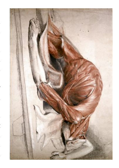
Illustration 7.1 © Wellcome Trust, Image Collection, L0013340, 'Lateral view of the trunk of a flayed corpse', by Charles Landseer, 1815; Creative Commons Attribution-NonCommercial-ShareAlike 4.0 International License (CC BY-NC-SA 4.0)

After the Murder Act, historical actors who attended executions and criminal dissections both internalised and externalised their 'natural curiosity'. They had sensory agency to see and hear a biological soundscape; to stare, gasp, gossip, joke, and half-remember conversations amongst post-execution crowds about how it made them feel to be part of the spectacular. Lacking first-hand evidence penned by ordinary people in an oral culture, this book has explored the physical qualities of a shared emotional history at criminal dissections that was accessible and stimulating in some respect to everyone. Seeing something reachable did not necessarily make it a reductionist experience in terms of medicine wielding power. Instead when the criminal body was about to be dissected, uppermost was not the pathology of death. It was a