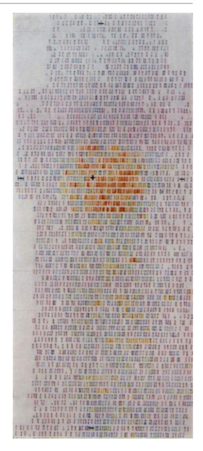
Fig. 15.1 Colour ribbon printout of an <sup>87m</sup>Sr bone scan performed on a rectilinear scanner (Reproduced with permission from Kemp et al. [20])