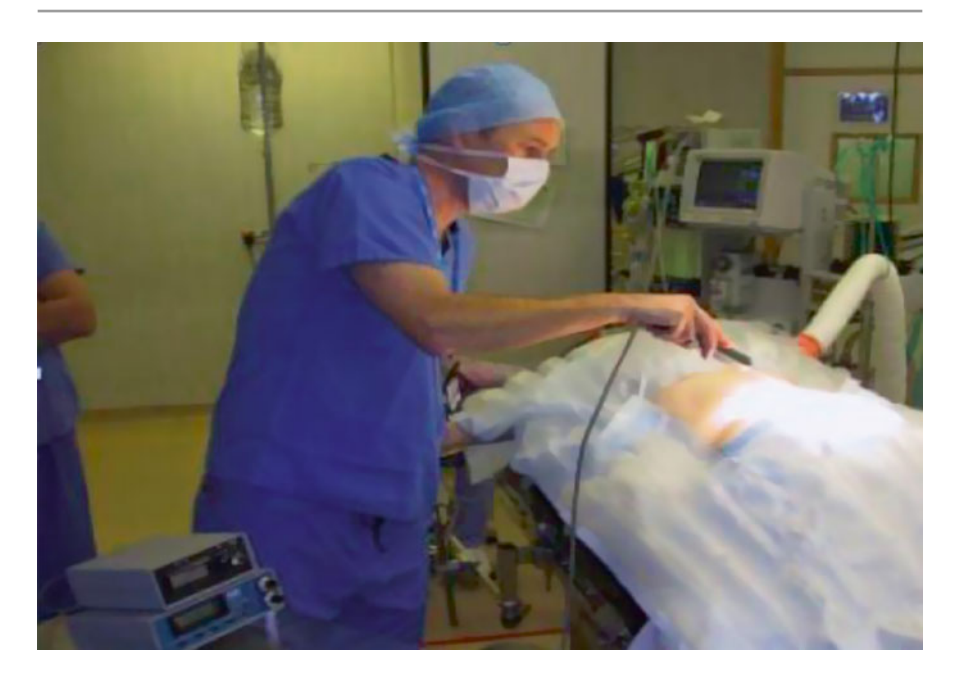
Fig. 13.2 The author using an early gamma probe in the operating theatre in the 1980s

serum albumin [10] a spin off from the Bass brewing industry and recombinant branched-chain polypeptide synthetics [11] and aptamers [12]. Perhaps more unique to Nottingham was the use of nuclear medicine techniques in the study of conventional drug delivery and formulation. Extensive studies were undertaken to image the release, delivery and biodistribution of formulations including enteric coated oral dose forms, enemas, eye drops, nasal sprays and aerosols [13–15]. Much of this work has involved the study of tablet swallowing [16], gastrointestinal transit, the understanding of gastrointestinal physiology and the development of nuclear medicine imaging techniques for the study of the gastrointestinal tract Fig. 13.3 [17].