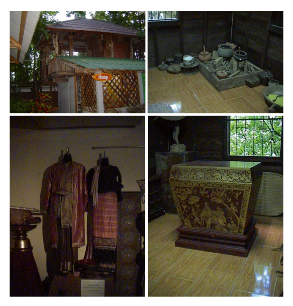
Fig. 4 Tai Khoan Museum at San Kang Pla Temple, Chiang Mai

around the temple to preserve their identity and present their social life. He interacts with the Tai Khoan community by calling for cooperation in building a traditional Tai Khoan house to be a museum in the temple area and donation of appliances to collect and display in the museum. Each year, the abbot will organize a Buddhist event so that visitors will visit this museum and see its merit. He said that the community of Tai Khoan will benefit from selling local products to visitors in this event.