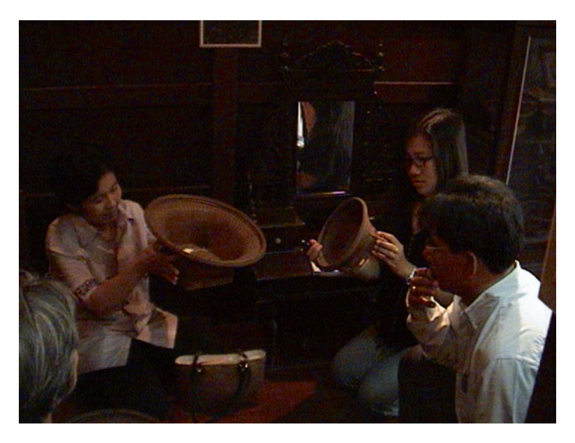
Fig. 1 Ban Kamaoon Museum, Chiang Mai: a private museum