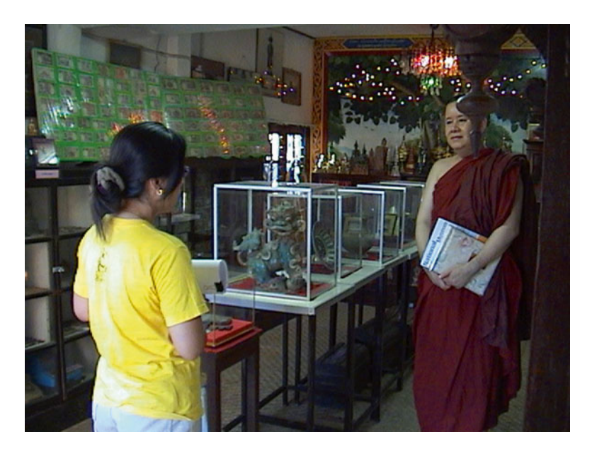
\textbf{Fig. 3} \ \ \text{Wat Pazang Museum, Lamphun: a local museum located in a temple and managed by an abbot of Pazang Temple}