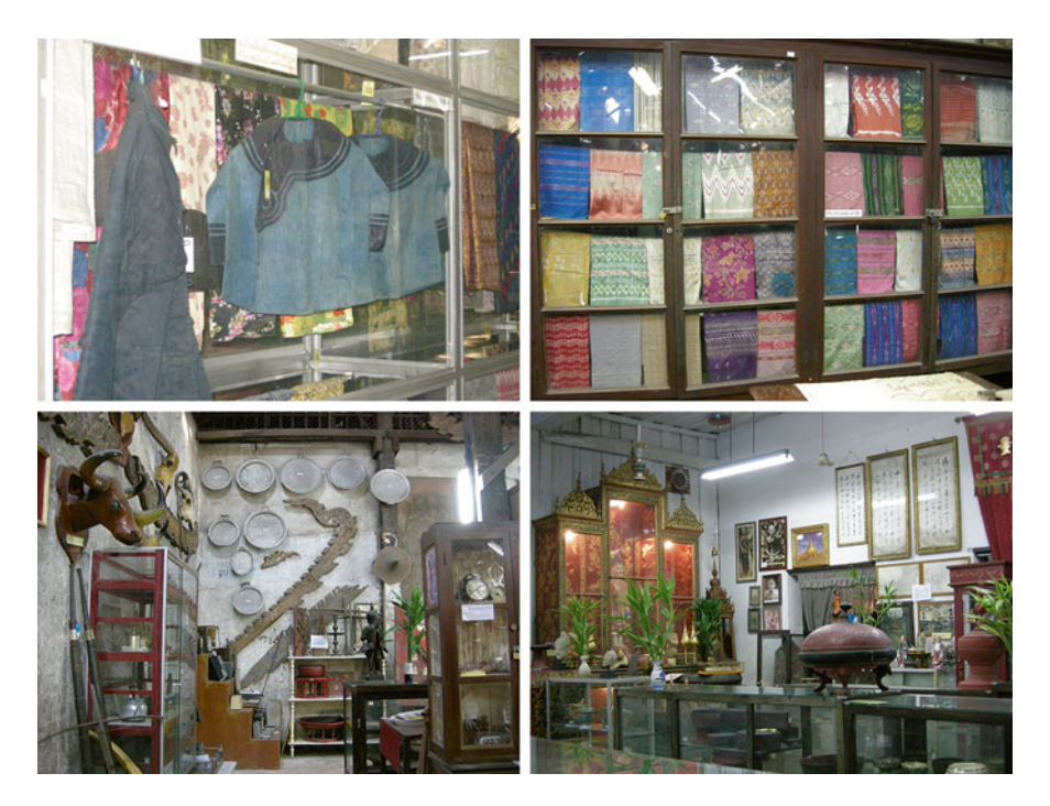
Fig. 6 Wat Kaet Museum: a local historical museum

The First Royal Factory Museum (Fang) in Chiang Mai (Fig. 7) is a museum where the current effects of royal projects in development of the ethnic communities in the area are displayed. The museum tries to interact with the community around the museum through the "Youth Guide": the youth who take a guide training and