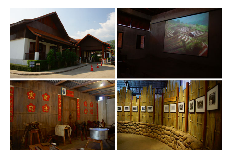
Fig. 7 The First Royal Factory Museum (Fang) in Chiang Mai

work at the museum in their holidays. The museum staff support them in guiding visitors through the village. The museum said, this is a way to link museum's content and benefit to the community around museum.