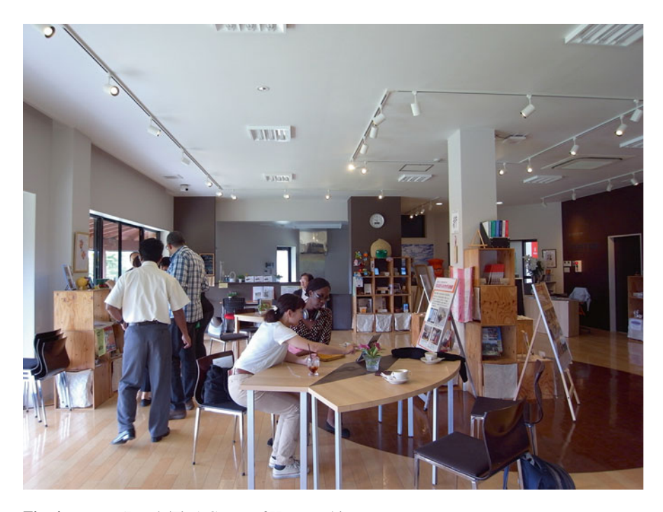
Fig. 4 Kizuna (Bonds/Ties) Center of Kawaguchi