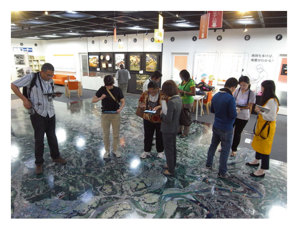
Fig. 2 Nagaoka Earthquake Disaster Archive Center – Kiokumirai (Memories for the Future)