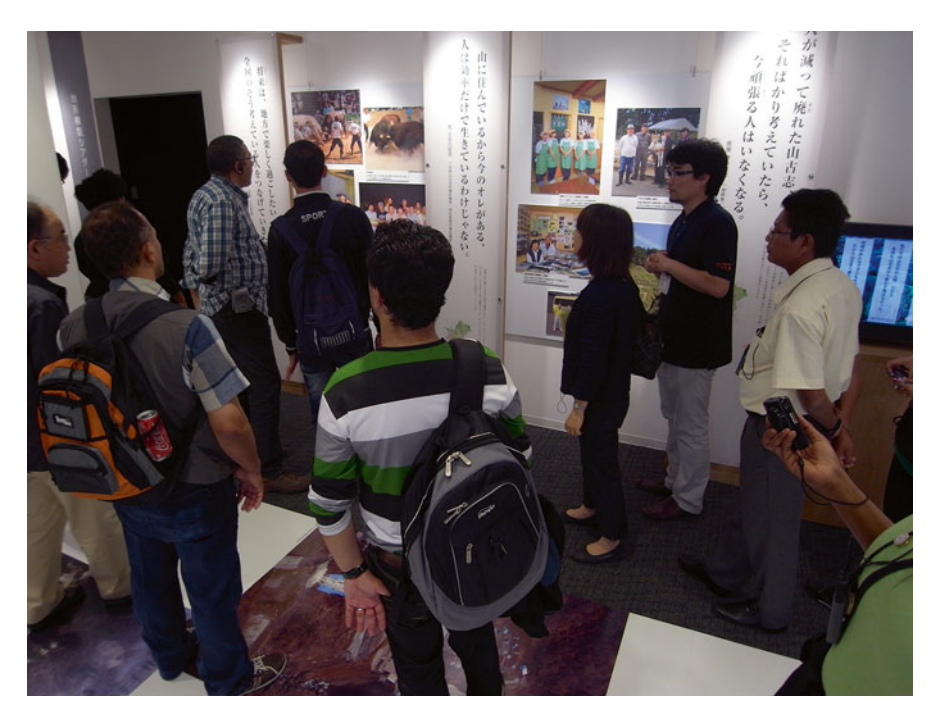
Fig. 5 Yamakoshi Restoration Exchange Center—Orataru (My/Our Place)

revive their hometown, even after being subjected to the extensive destruction of the earthquake.