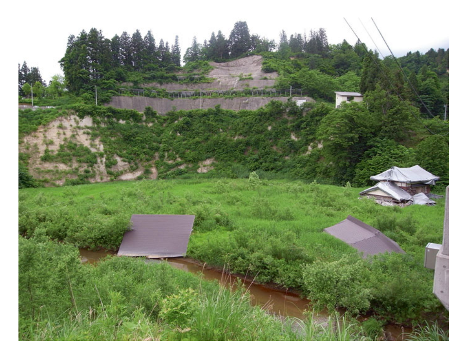
Fig. 7 Kogomo Memorial Park