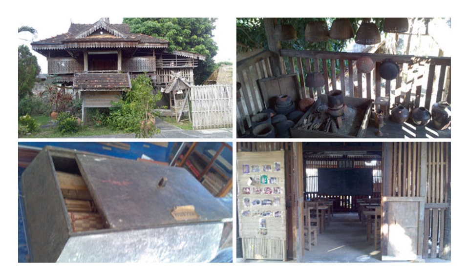
Fig. 5 Tai Yong Museum at Pa Tal Temple, Chiang Mai

Khoan Museum, but its management is different. The Tai Yong are an ethnic people who live around Pa Tal Temple. In 1999, they started to establish a museum in Pa Tal Temple, which is the center of the community, to present their unique culture and call for their ethnic people's rights to be admitted by society. They also use the museum as an ethnic cultural center for their youth.