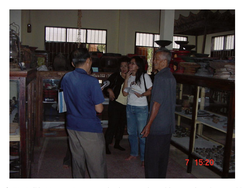
Fig. 2 Wat Laihin Museum, Lampang: a local museum located in a temple and managed by a community of Ban Laihin village