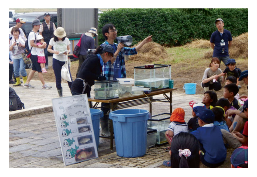
Fig. 4 Museum researchers providing support to public viewing programs

mainly conducted by local farmers' groups and coordinated by officials of the local government (Kanao and Ohtsuka 2013) (Fig. 4). It is hoped that such collaborative and interactive activities including the Lake Biwa Museum among the actors will produce further social innovations that bring a "better relationship of coexistence between humans and lakes" closer to fruition.