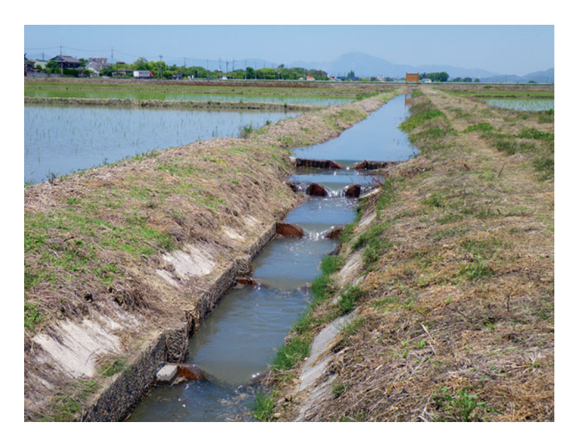
Fig. 2 A fish-ladder cascade set in a drainage canal