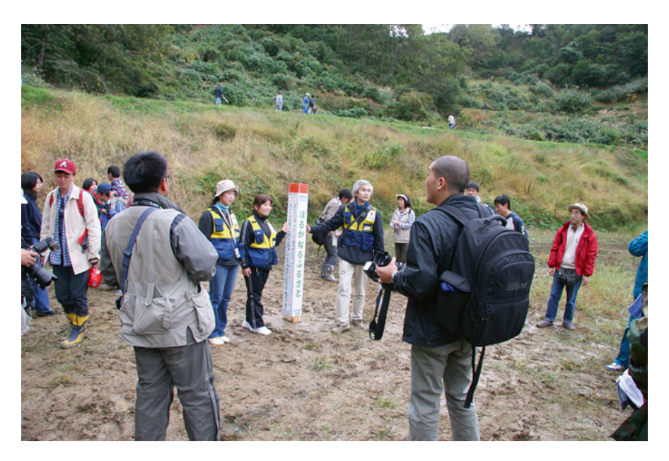
Fig. 8 Epicenter of the Chuetsu Earthquake Memorial Park