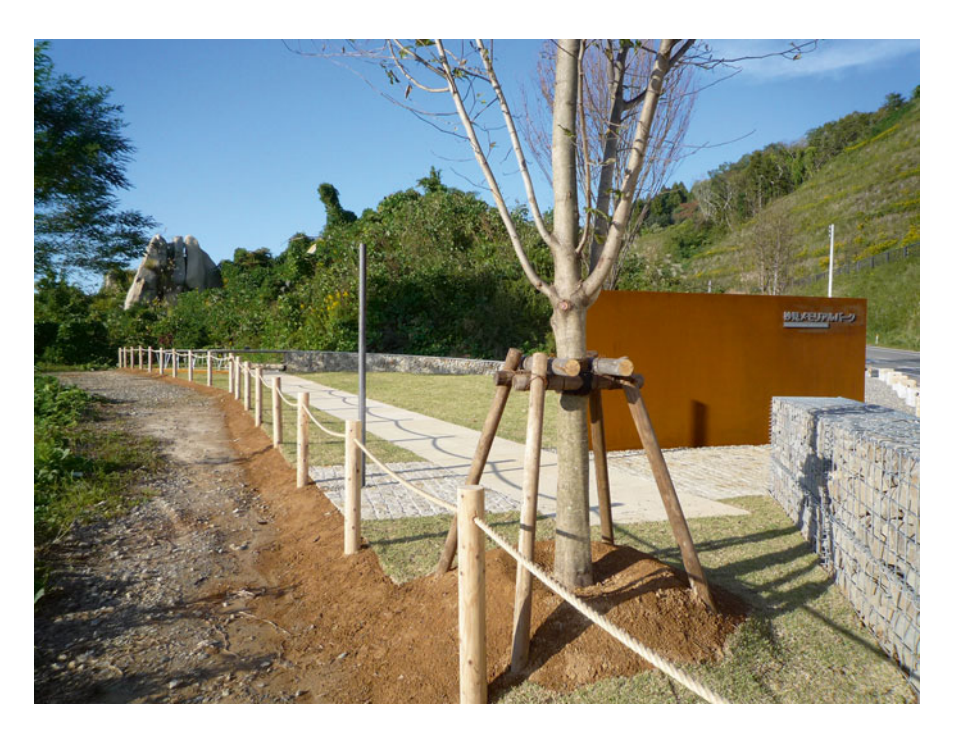
Fig. 6 Myoken Earthquake Memorial Park