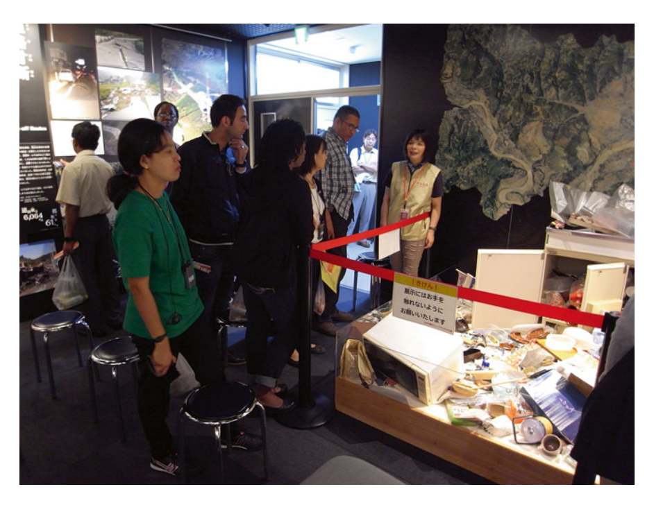
Fig. 3 Ojiya Earthquake Disaster Museum – Sonaekan (Preparedness)