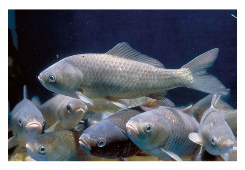
Fig. 3 Round crucian carp, Carassius buergeri grandoculis