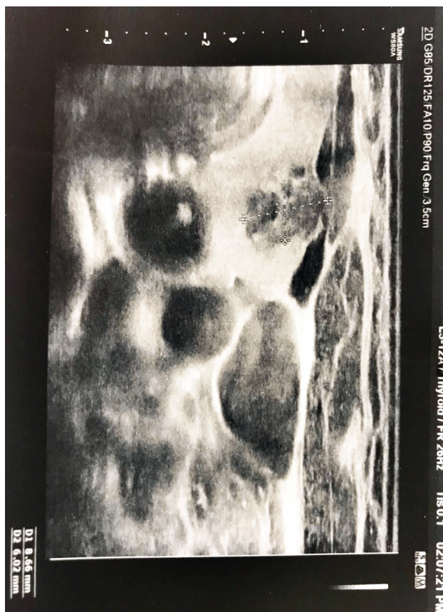
Figure 1: Thyroid ultrasonography showed a large lobulated cystic lesion in the left thyroid lobe.

Not only did the hematologic and biochemistry laboratory tests reported normal, but also the thyroid function tests reported normal as well. FNA result was benign. Patient underwent left lobectomy and isthmectomy without any complications during surgery