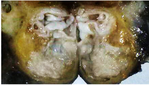
Figure 2: A cystic lesion with smooth whitish wall in lower pole left thyroid lobe.